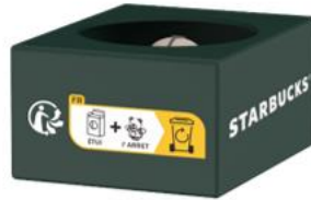
Figure 1c: France Sorting Label Example