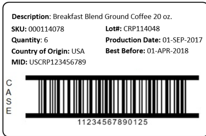
Table 3b: Canada - Shipping Label Data Requirements: Production Date and Expiration/Best Before

This is an example of the information required on a Case label for a perishable product. The format is not a requirement, but all data shown, including “data field labels” must be present. The example below is printed on white label stock, so Bearer Bars are only required above and below the GTIN barcode. The product is palletized, so the PO number is on the pallet label, not the case label.