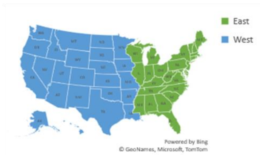
Figure 2. Origin State Map – Transportation Regional Contact (as referenced in Table 9)

Parcel shipments, except to/from/within Canada – All parcel shipments, except to/from/within Canada, are shipped via FedEx. Suppliers must validate all parcel shipments within the required lead time. Suppliers are divided into two categories (all Suppliers, independent of category, must contact their Authorized Starbucks Representative to initiate this process):