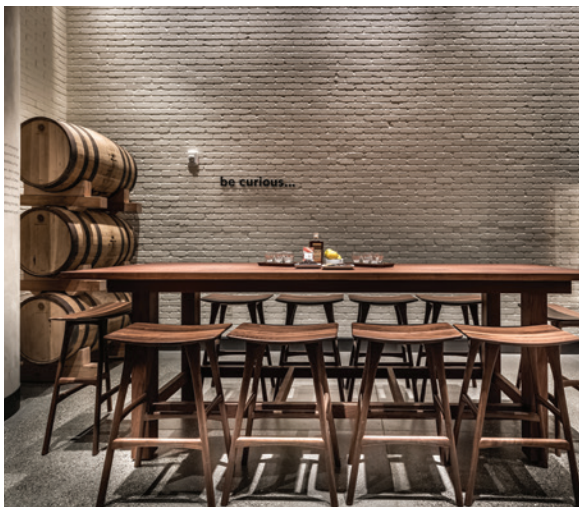
COFFEE INNOVATION LAB