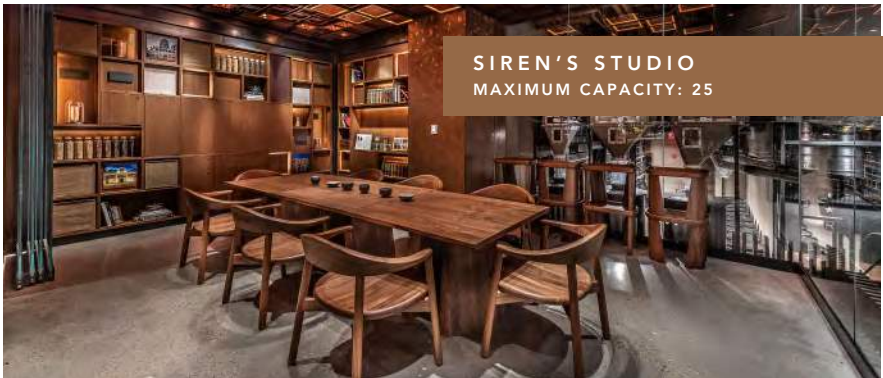
SIREN'S STUDIO MAXIMUM CAPACITY: 25