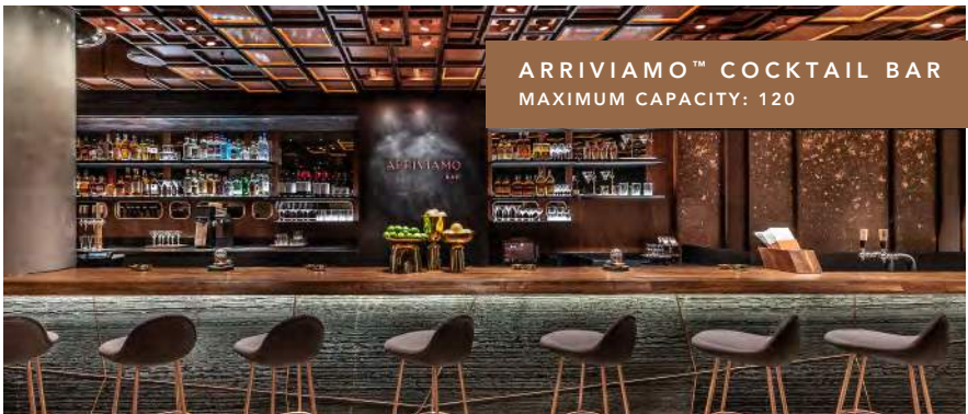
ARRIVIAMO™ COCKTAIL BAR MAXIMUM CAPACITY: 120